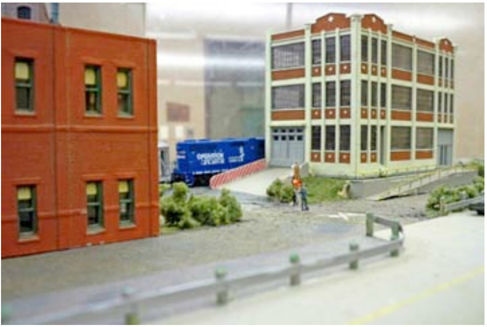
Dennis Lloyd loves to make buildings for his modules (and for other's too). This is just one example of the many buildings he has assembled or scratch built. His favorite activity is to take a picture of a building, buy some kits and styrene sheets, "bash" it all together, and see how close he can make the model match the photo,