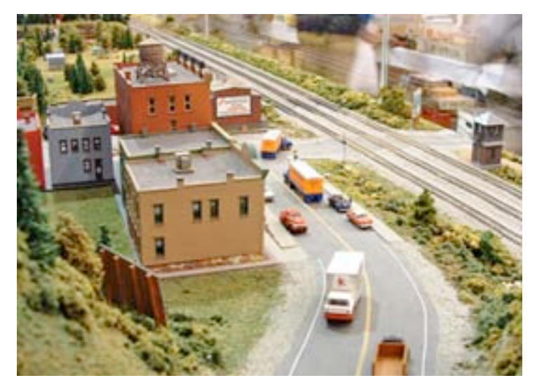
Note the train running below the bridge in the center of the picture. Bob Varga's multiple module set provides plenty of action for guests by operating a "private railroad" below (and behind) the standard NTRAK lines.