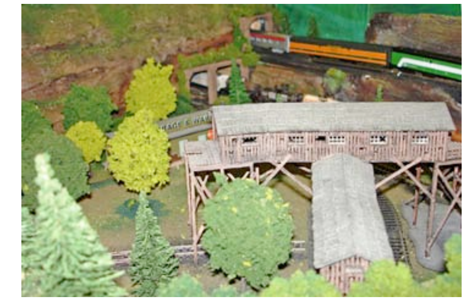
NTRAK Page 12