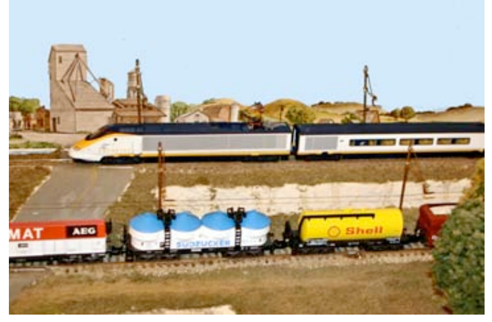
N -Cat using "live" catenary. Note the single pantograph on the rear of the power unit.

style" module which ran in a "depression", as the rest of the table top was elevated about 3". Clarence Hanold (one of the founders of the group) modeled a European village, with multiple trains running throughout, utilizing live catenary power. He went as far as rewiring