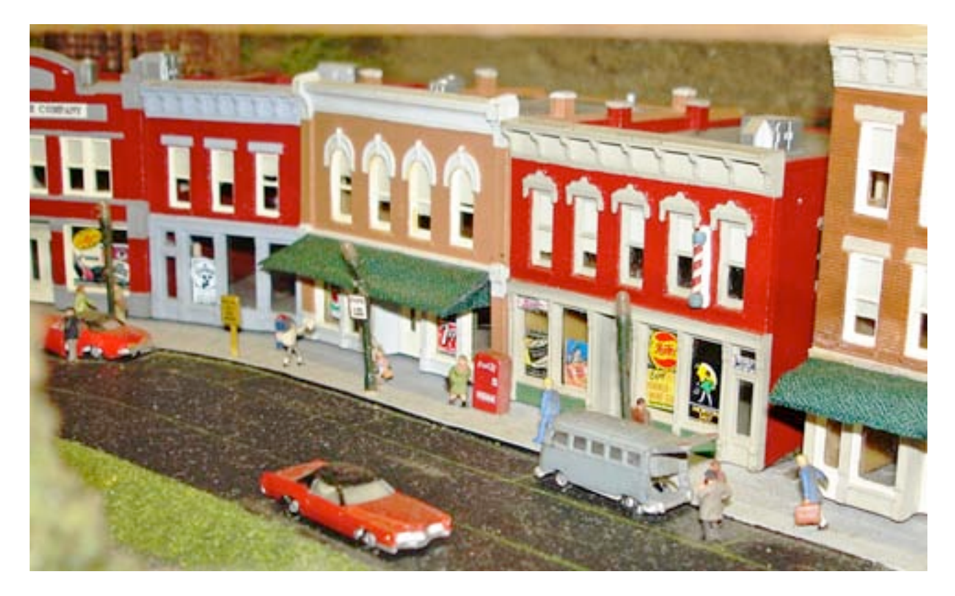
John Evans (deceased) was a stickler for details as seen in this small town street scene. Note the operating street lamps, signs, window shades, and posed people. The "implied action" of the details make the scene appear to come alive.