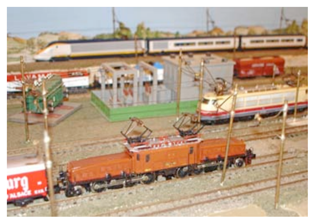
A busy yard area using "live" catenary power. Note the pantographs used to get power for the consists. NTRAK Page 9