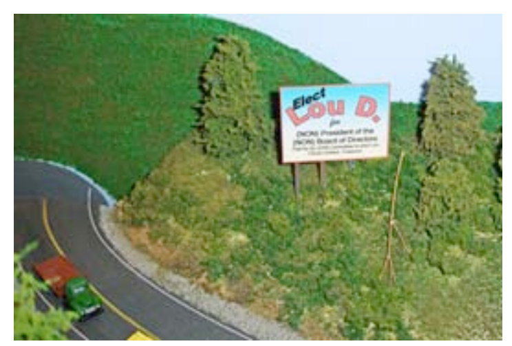
Good natured ribbing gets serious as noted on this billboard on Chuck Limbert's module. LENS does not have a formal structure governing their group, but some members just won't "leave it alone".

As with many clubs today, the demographics are changing. Currently we have 12 active members (average age of 53), and an additional 10 people that come to help out at the displays. We are finding it harder to get a continued commitment to our group and hobby from younger people. When I was a kid, model trains were one