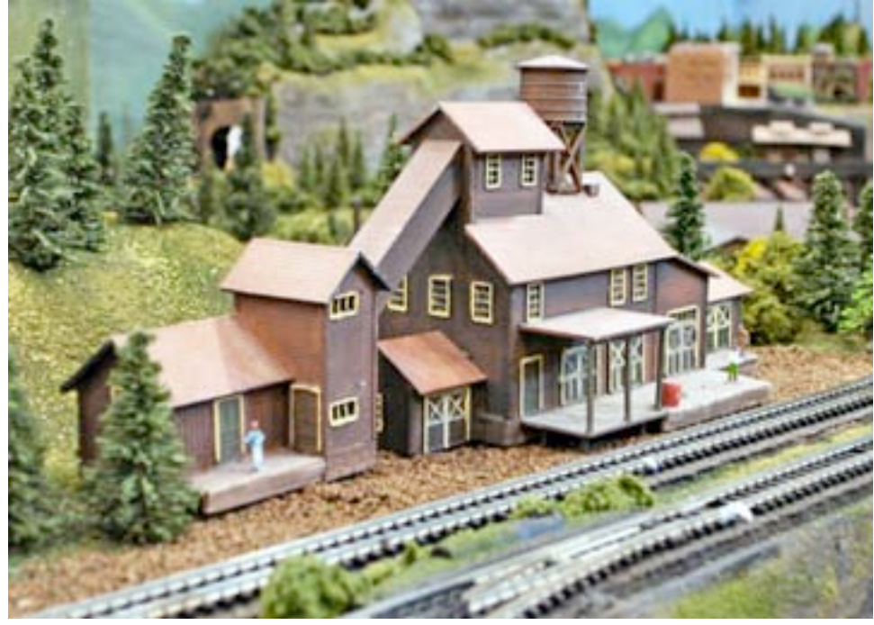
NTRAK Page 11

This young guest is anticipating the arrival of a train from a tunnel. Perhaps she will be interested in modeling trains someday in her future.