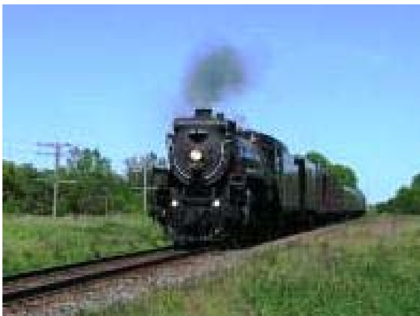
CPR 2816 runs through Port Hope, Ontario

( I have it on good authority that the engine stopped in Conneaut, OH, where a few rail fans had an opportunity to “get up close and personal”. -ed )