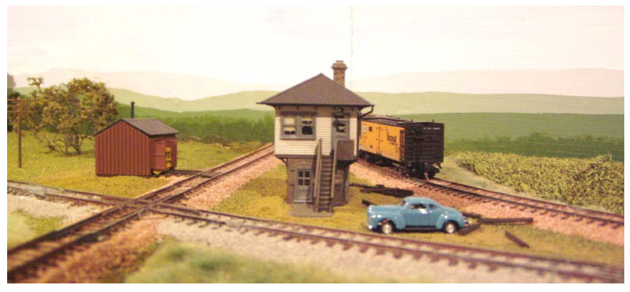
Also included is a plan of the entire layout. For more information, see <u>http://www.cgwrr.com/</u>.