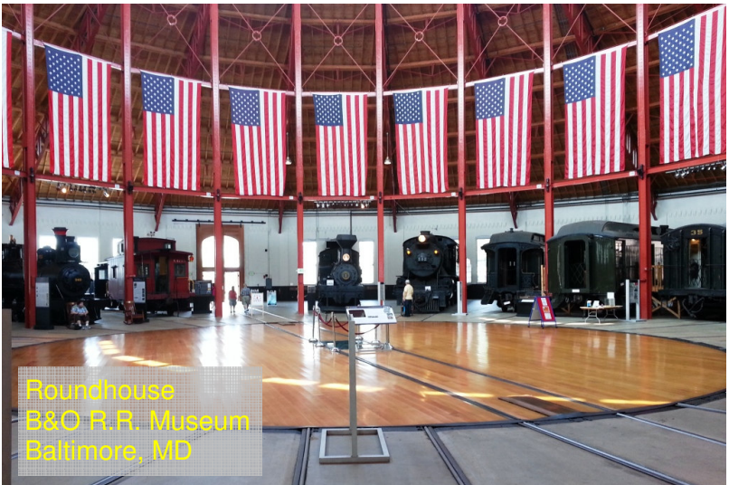
Roundhouse B&O R.R. Museum Baltimore, MD