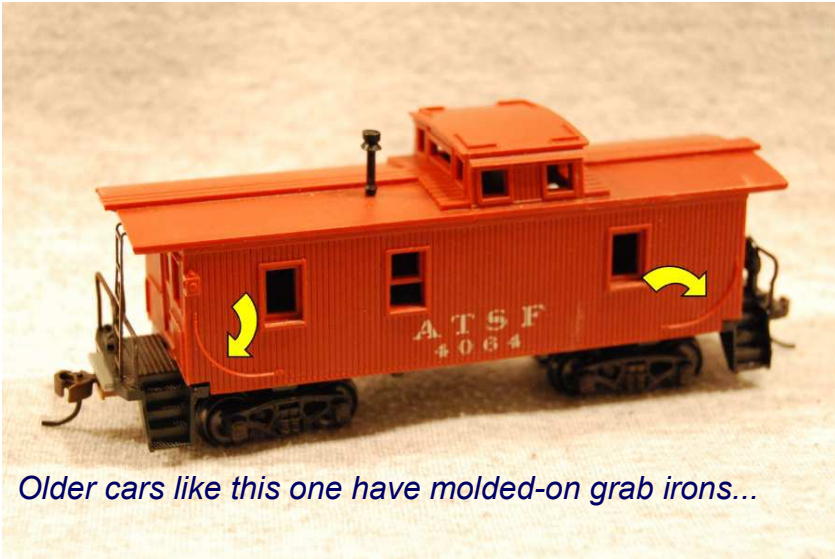
Older cars like this one have molded-on grab irons...