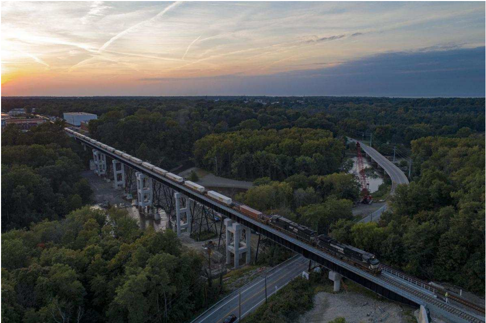
New NS Bridge in Painesville