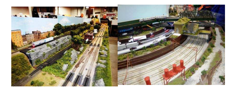
Northeast N-Trak (Layout) (4 photos)