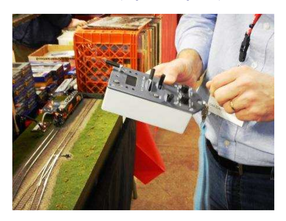
Springcreek Model Trains (Throttle)

10 . E. N. S. February 2019 <u>www.lensohio.org</u>