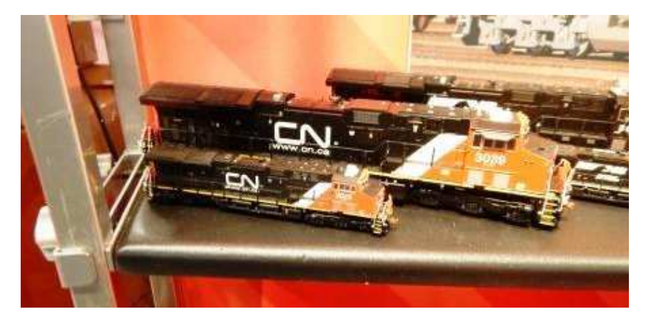
ScaleTrains (Engines Rolling Stock)