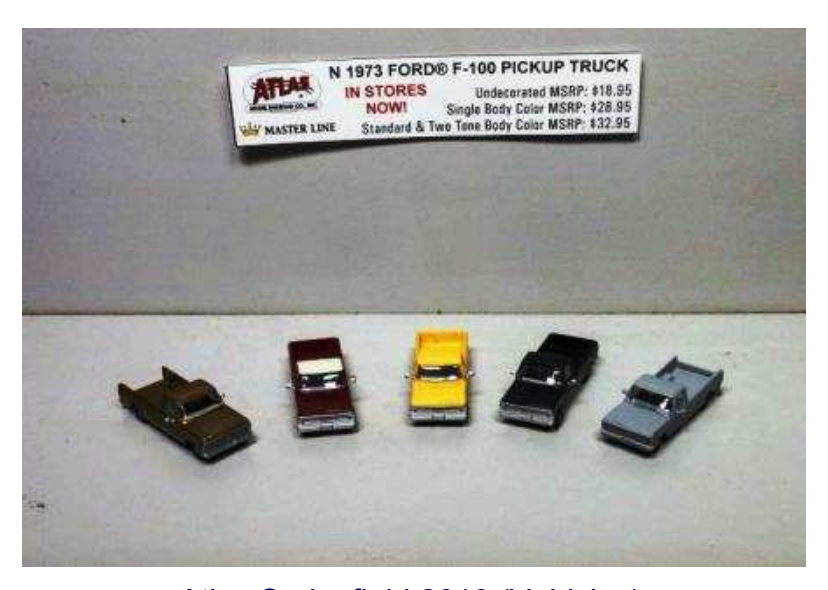
Atlas Springfield 2019 (Vehicles)

Springfield Railroad Hobby Show Wrap-Up As some of you may know, I chose to skip the annual January meeting held at Dave Neff's place and make the 530-mile trek to western Massachusetts and attend the Amherst Railway Society's Railroad Hobby Show (a.k.a. Springfield). This is one of the larger if not the largest rail shows in the country, with a little more than 400,000 square feet of displays, vendors, exhibits, etc. And yes I did get that right, it's 5 zeros following the 4, or just a little bit larger than 9 acres of railroading under four roofs. They estimate that some 22,500 railfans and public attend the show. To do it justice, you really need to budget two days to see all of the show, although it can be done in one day if you skip over a lot of tables.