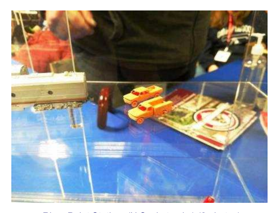
River Point Station (N Scale trucks) (2 photos)