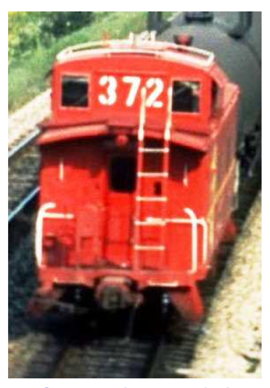
See you at the next station!

Copyright 1999-2019 The Lake Erie N Scale Society