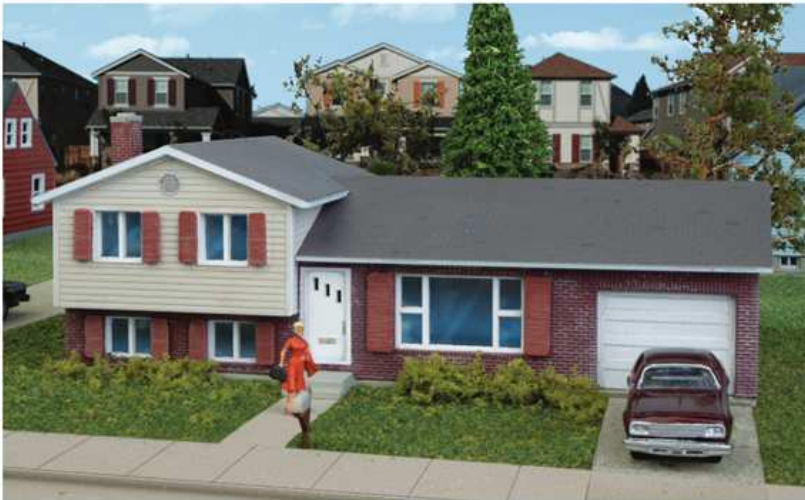
Figures, vehicles, and scenery items not included

Split-Level House Kit 933-3840 Measure: 4 x 2-1/4 x 1-1/2" 10.2 x 5.7 x 3.8cm