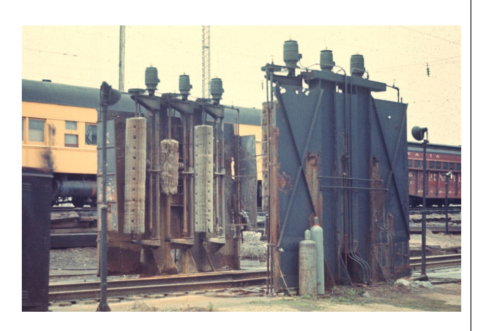
PRR Car Washer