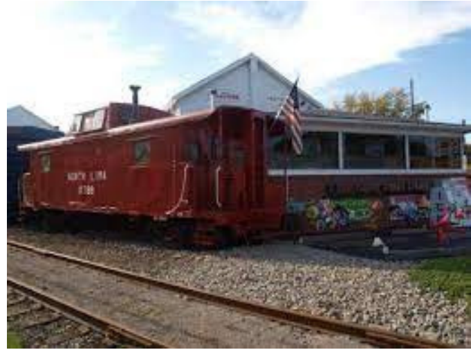
The caboose and front of the store

The Friday following Thanksgiving the wife and I took a trip down near Youngstown. We went to visit Kraynak's, a holiday/gift store, which is just across the OH/PA border. While we were down there I, of course, was looking around for any stores selling model trains. showing up