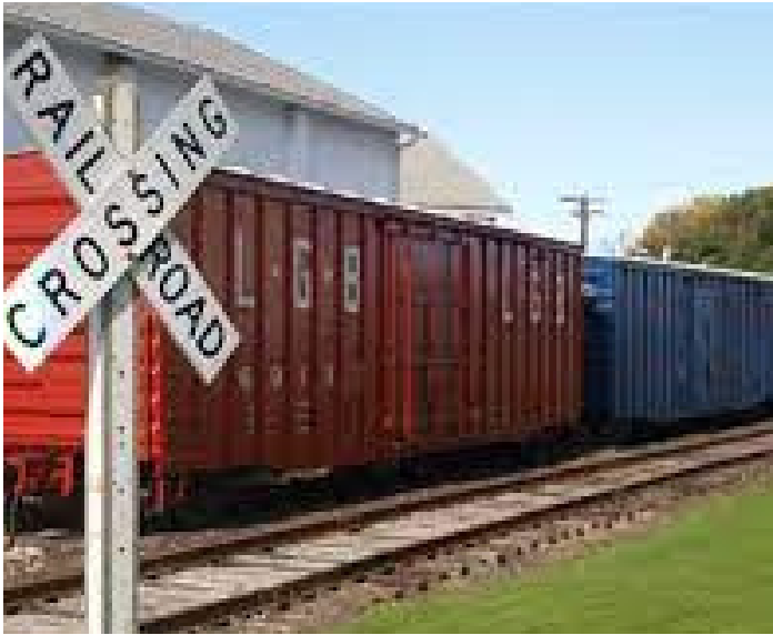
Box cars alongside the store

....amount of O-scale. Hoping there might be more we went up the stairs nearby that led to a large assortment of.....G-scale. With extreme disappointment we decided left, the only thing of interest being found was a striped railroad hat that was big enough to fit my large head. It was not anything like I had hoped given the name “The